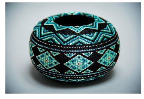
Sally Anaya, Aurora